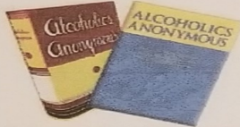
12 Step Big Book Workshop on AA's 12 Steps