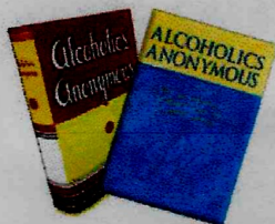
12 Step Big Book Workshop on AA's 12 Steps