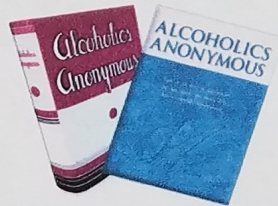
12 Step Big Book Workshop on AA's 12 Steps