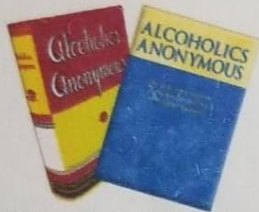
12 Step Big Book Workshop on AA's 12 Steps